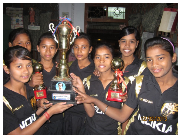
The Runners Up!

Some girls attended an exhibition/workshop on Earth Day where they learnt to make paper jewellery using old magazines. Girls from the Special Education class went to Victoria Memorial Museum on World Environment Day helping paint tree trunks in the gardens and were commended for their enthusiasm.